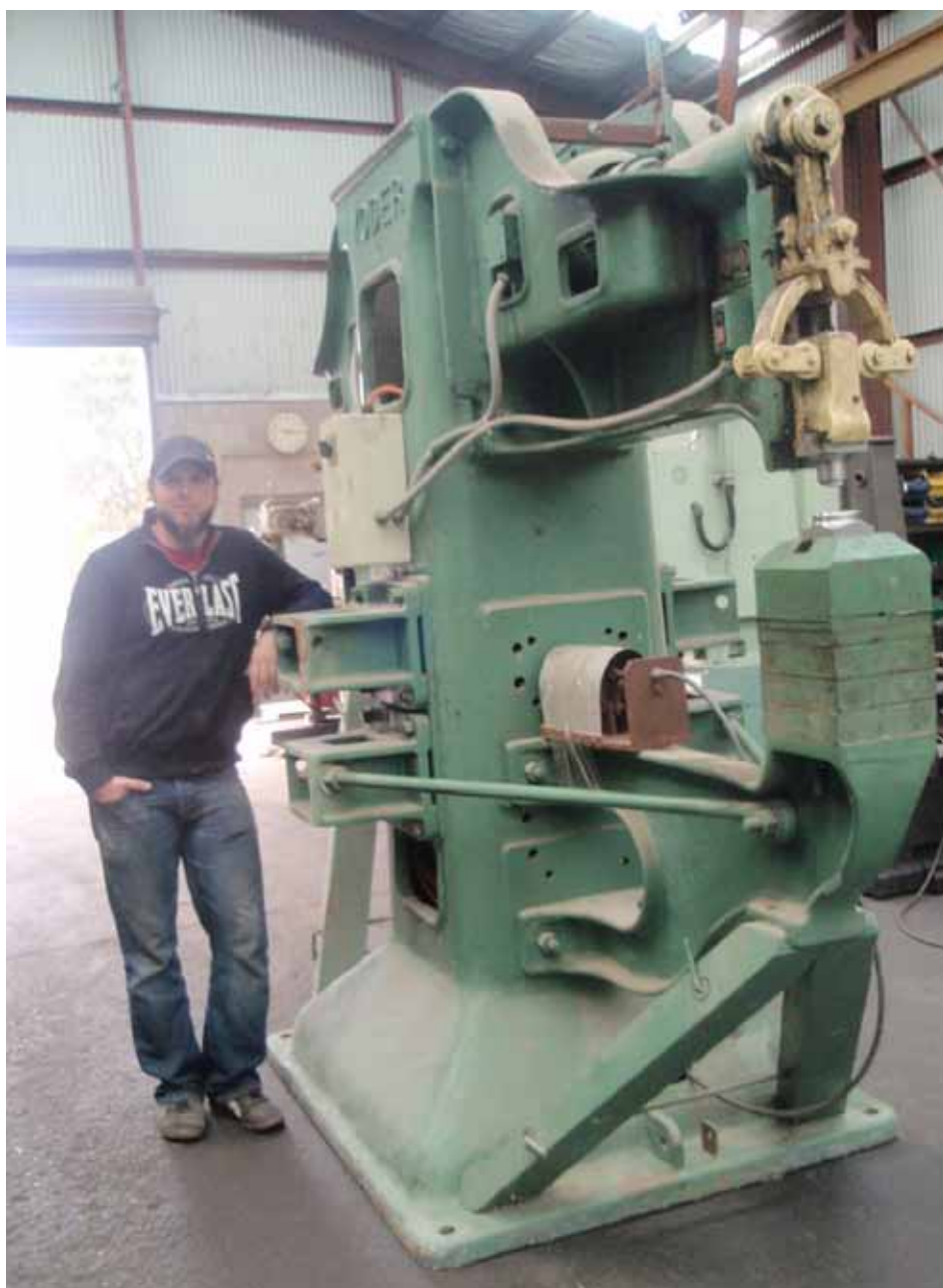
The Fellow and his power hammer

Australia has an excellent skills training system and the power and air planishing hammers could easily be fitted into already existing TAFE metal work curricula. The wider use of these machines would give the automotive industry the capacity for faster builds and the ability to better accommodate small volume production. A skills upgrade through the wider use of the power hammer would make the panel forming industry in Australia more competitive for automotive and wider applications.