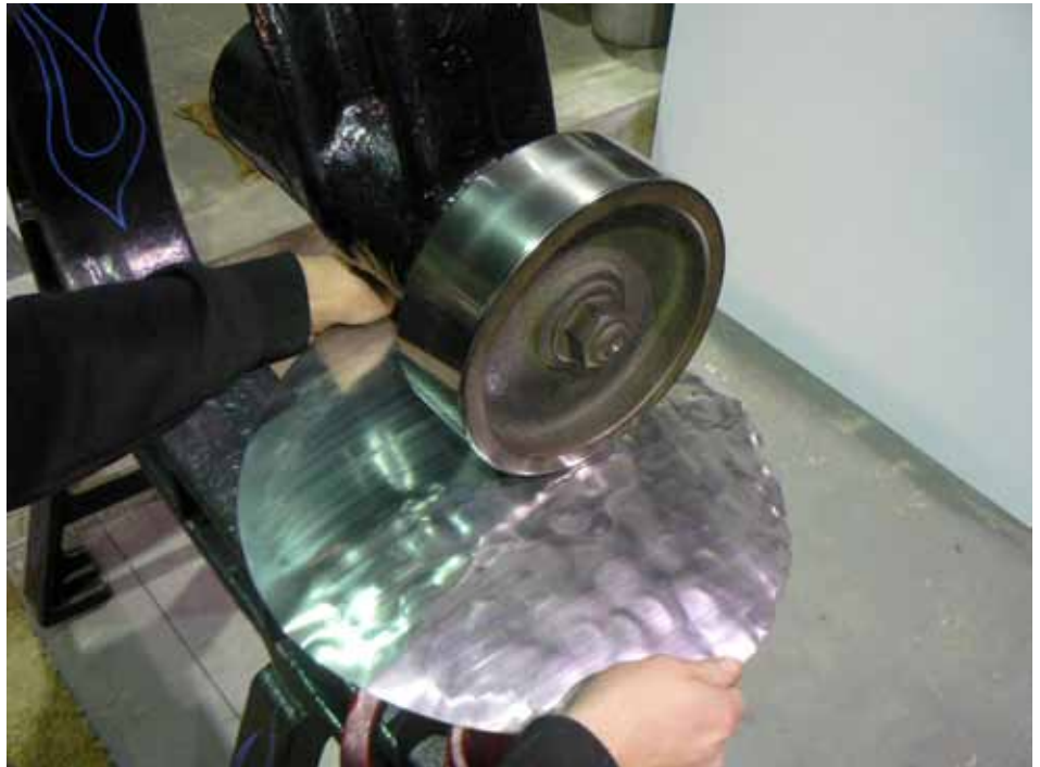
Finishing in a wheeling machine after blocking