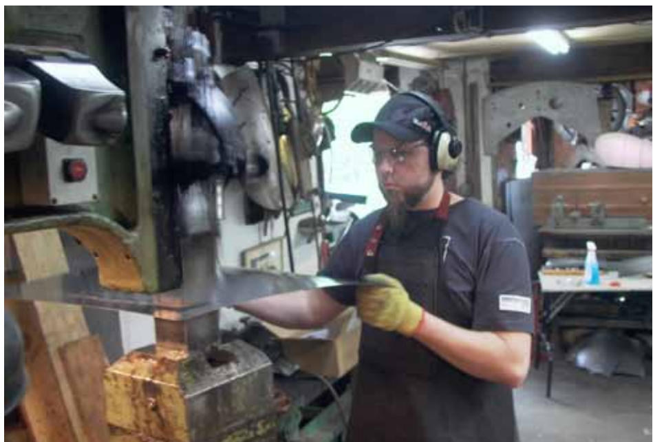
Stretching on the power hammer

Using sheet metal shaping equipment such as the wheeling machine to create compound curve shapes is much slower than the power hammer. Power hammers are faster, provide more control in the shaping of high-volume areas and they are more time efficient. The power hammer has the ability to shape a 0.125 inch single sheet of steel, shrink fourteen gauge steel sheet and stretch four sheets of 0.057 inch thick steel stacked together.