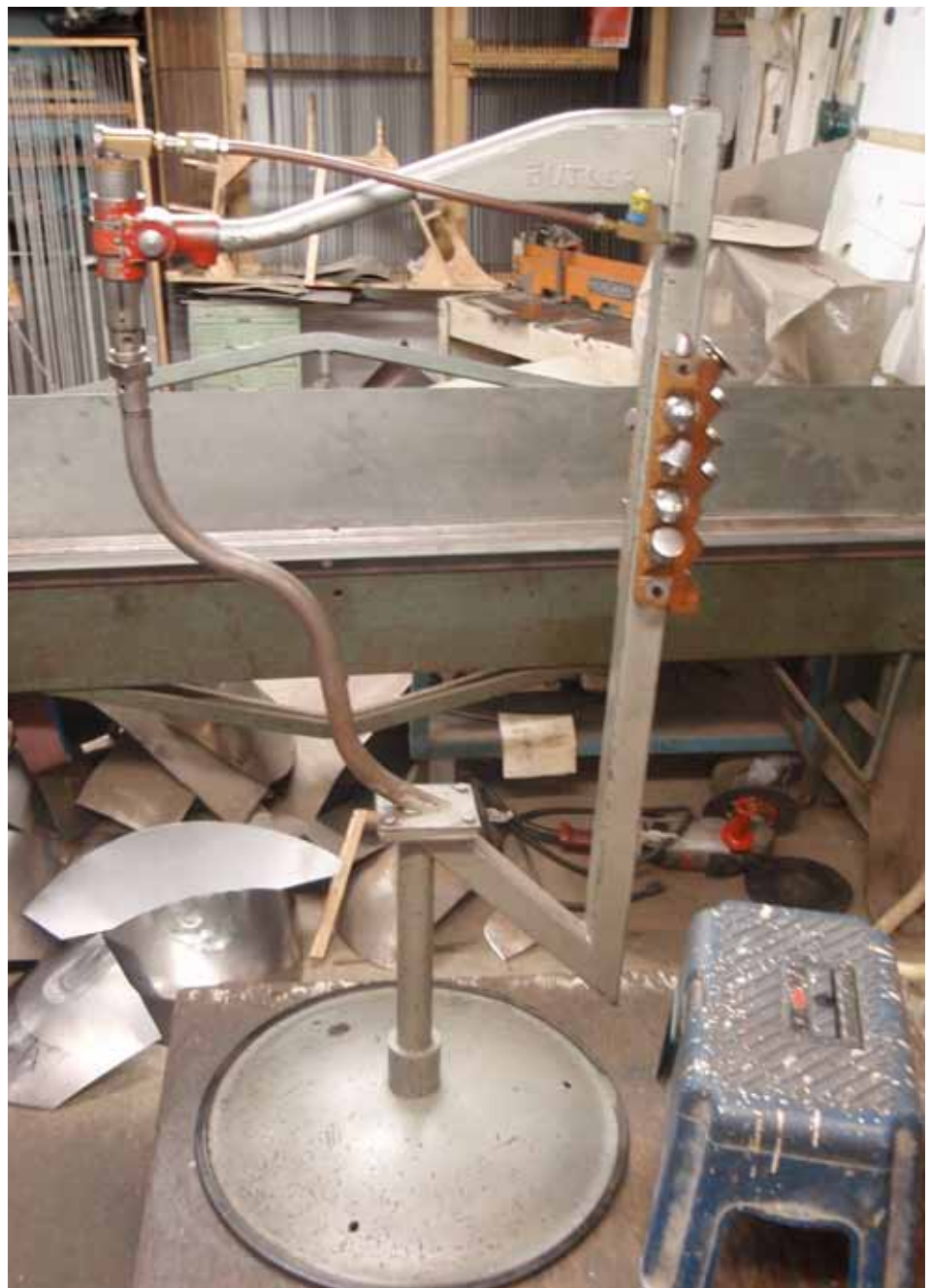
Air planishing hammer

Depending on the application the air planishing hammer can be both hand held or utilised on a stand. The air planishing hammer has a longer reach capacity into the centre of very large panels than the conventional hammer and dolly. It also complements the power hammer in smoothing shapes and blending slight highs and lows in panels.