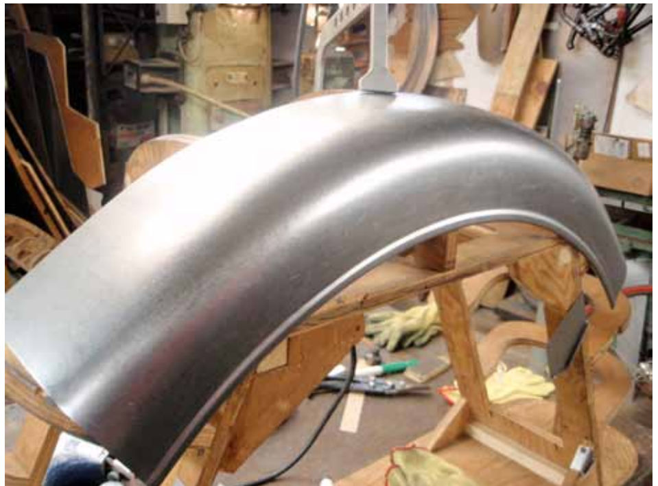
Bead or swage in panel.