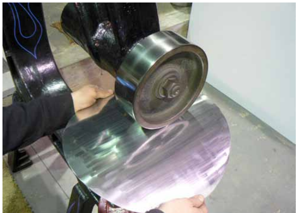
Photo of wheeling process