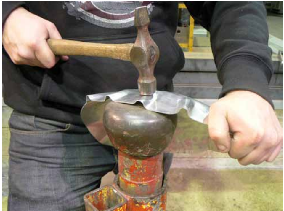
Compressing a tuck

The power hammer was developed in the early 20th century from blacksmith hammers in Amesbury, Massachusetts in the USA. The principle of the power hammer is similar to the wheeling machine in that they both shape the metal. While a wheeling machine is operated manually, power hammers generally have a three-horsepower motor. The speed differential between the two machines is significant.