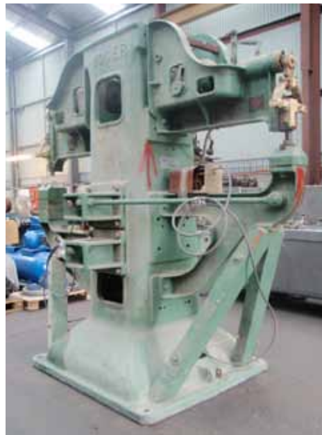
The power hammer

The ram also holds the top die, which is flat for stretching. A special matched set is required for shrinking and linear stretching. The lower arm has a heavy anvil attached to it that holds the lower dies directly below the ram. All the dies are held in with a tapered wedge key that allows for the dies to be changed quickly. A standard 12-die set consists of shaping dies, linear stretch and shrinking dies.