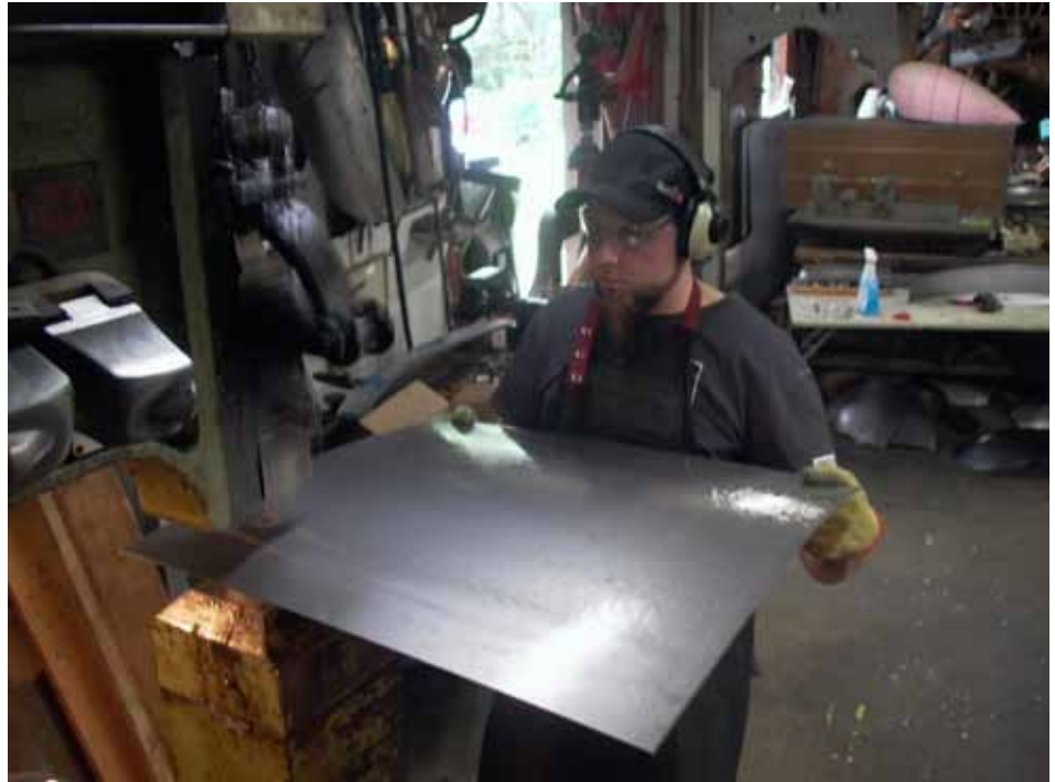
Stretching on the power hammer