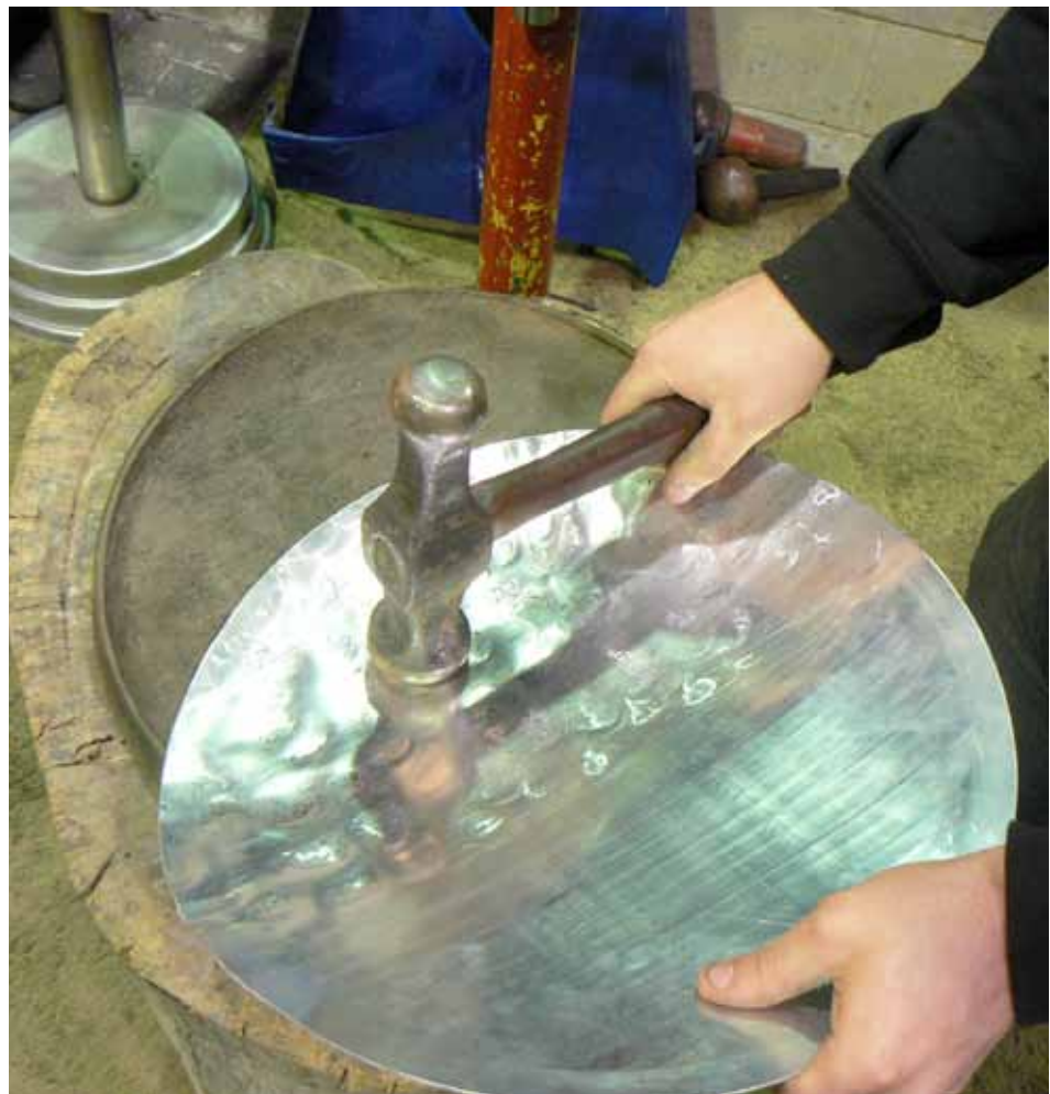
Blocking into sandbag

The second shape is a high crown. Examples of high crowns are components such as mudguards, wheel wells and nose cones. To create these shapes using a wheeling machine would take an exceptional amount of time. Blocking into a sand bag is one method to assist the shaping process. This involves beating the metal with a large steel mallet into a leather bag filled with sand or lead shot. This method has a deep draw effect on the metal and can cause uneven stretch, as it is hard to have each blow hit at the same pressure. Consequently, this process requires finishing on a wheeling machine.