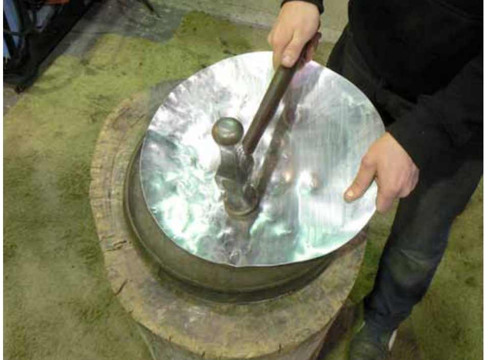
Blocking into sandbag