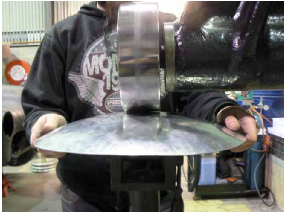
Finishing in a wheeling machine after blocking