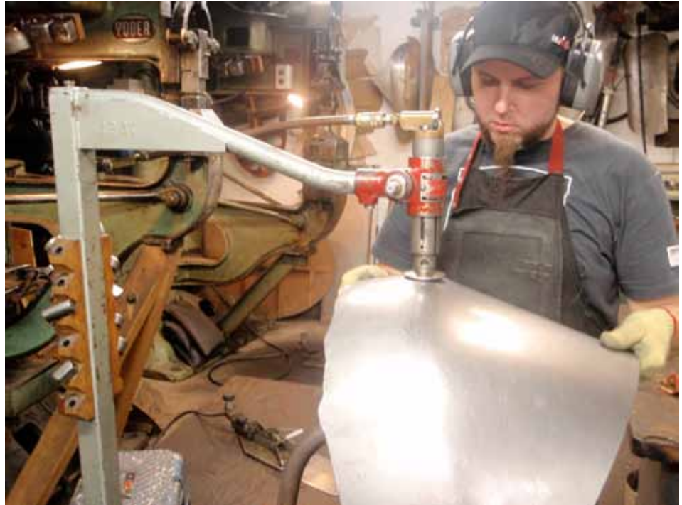
The Fellow smoothing in the air planishing hammer.