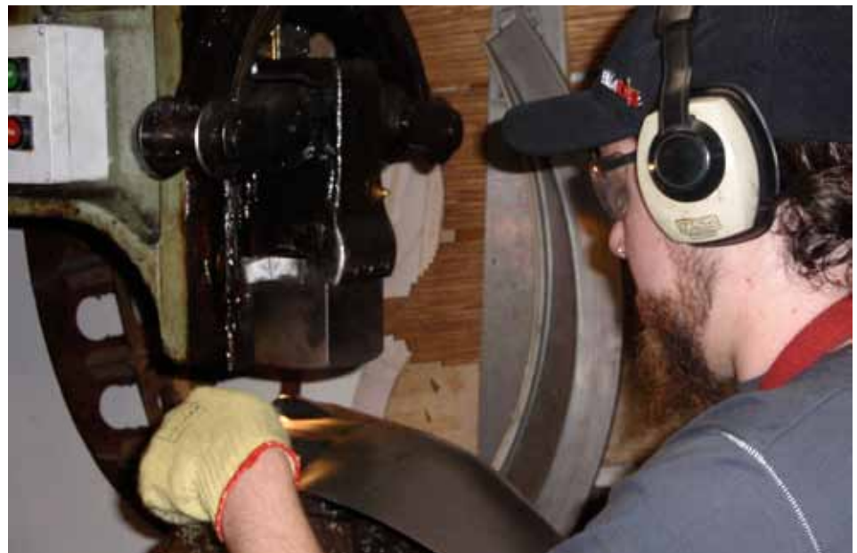
Shrinking on a power hammer

To use the power hammer to make a part the operator would first spray the top and bottom of the sheet metal with WD40 or a similar lubricant. This is necessary to protect the metal from being gored as it passes through the reciprocating forces of the machine. It also acts as a barrier to preserve the surface finish of the sheet metal. Next, the operator then places the sheet metal over the bottom die, presses the foot pedal to start the machine and then tracks the sheet from side to side, overlapping each pass until the desired shape is created. If stretching alone is not enough to reach the desired shape then shrinking dies can be installed to assist the shaping process. The ability to shrink and stretch sheet metal is important when shaping. A well made part will have minimal thickness change and will be a lot stronger, more dent resistant and longer lasting.