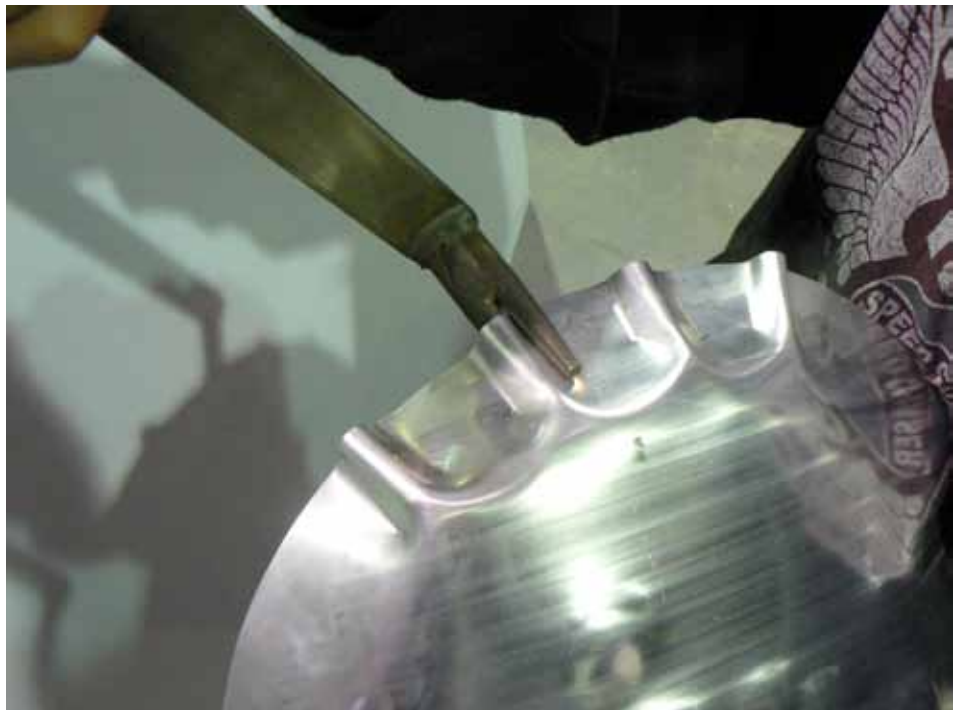
Pulling a pucker or tuck