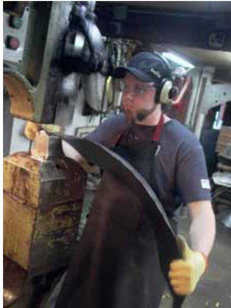
Shrinking on a power hammer