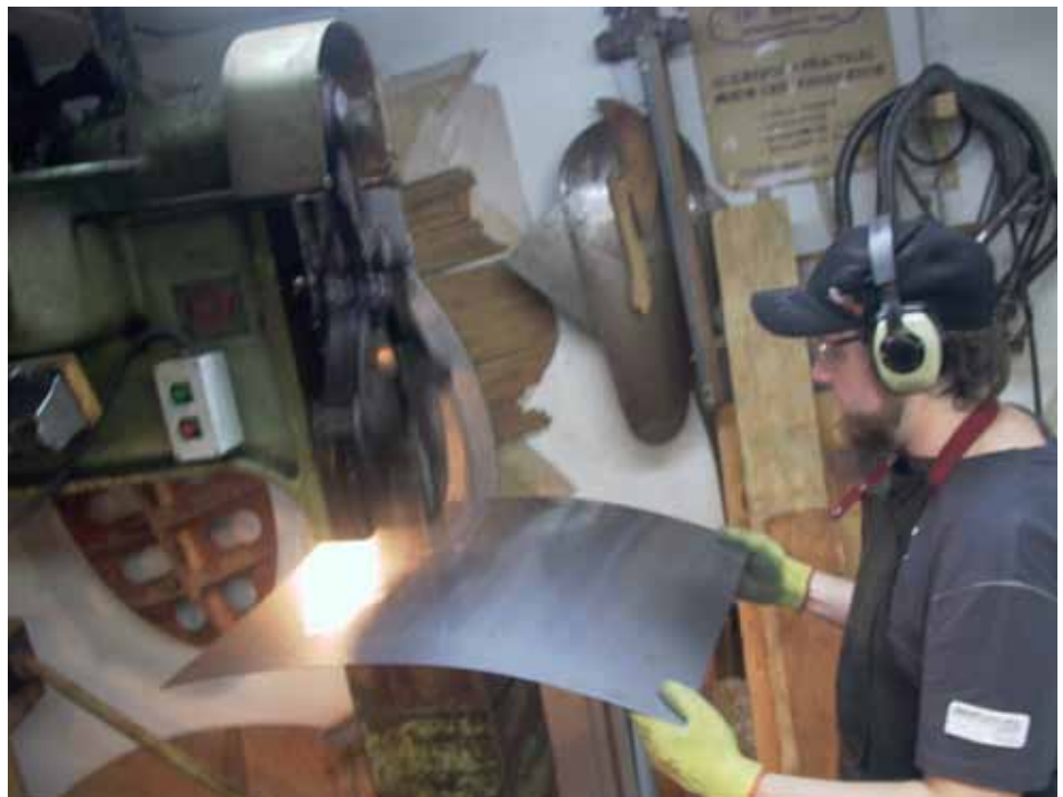
Stretching on the power hammer