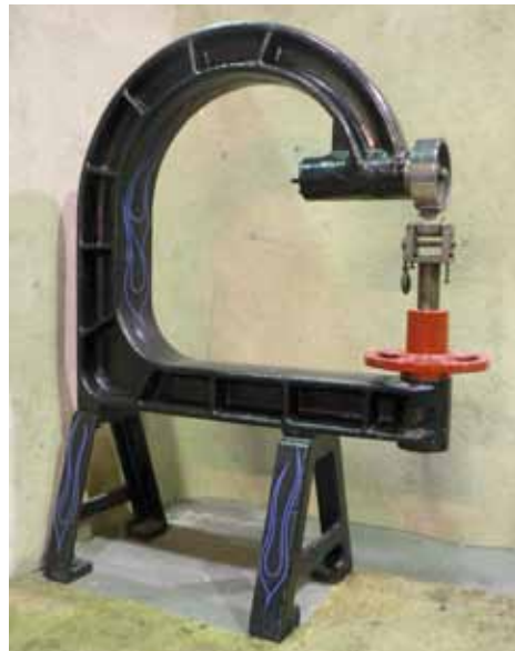
Stand-alone Wheeling Machine

Currently in Australia there are a variety of techniques for shaping sheet metal. To date, the most commonly used is the wheeling machine, or English wheel as it sometimes called. The wheeling machine is a frame made generally from cast iron and is shaped somewhat like a giant vertical 'G' clamp. It supports two steel rollers or 'wheels', one above the other, between which the sheet metal is placed. The wheel on the top is called the rolling wheel and the wheel on the bottom is called the anvil wheel.