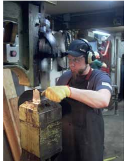
Shrinking on a power hammer

Using sheet metal shaping equipment such as the wheeling machine to create compound curve shapes is much slower than the power hammer. Power hammers are faster, provide more control in the shaping of high-volume areas and they are more time efficient. The power hammer has the ability to shape a 0.125 inch single sheet of steel, shrink fourteen gauge steel sheet and stretch four sheets of 0.057 inch thick steel stacked together.